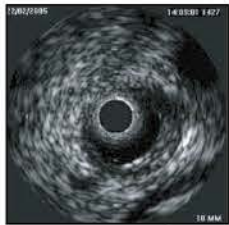
IVUS image of a vein

Placement of a stent (a metal mesh cylinder) in the iliac vein provides support to keep the vein open. Stent Implants are permanent.