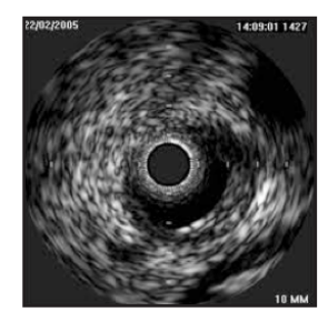
IVUS image of a vein

Placement of a stent (a metal mesh cylinder) in the iliac vein provides support to keep the vein open. Stent Implants are permanent.